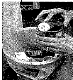
Place in opaque container