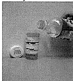
Mix with water and coffee grinds, cat litter, or dirt